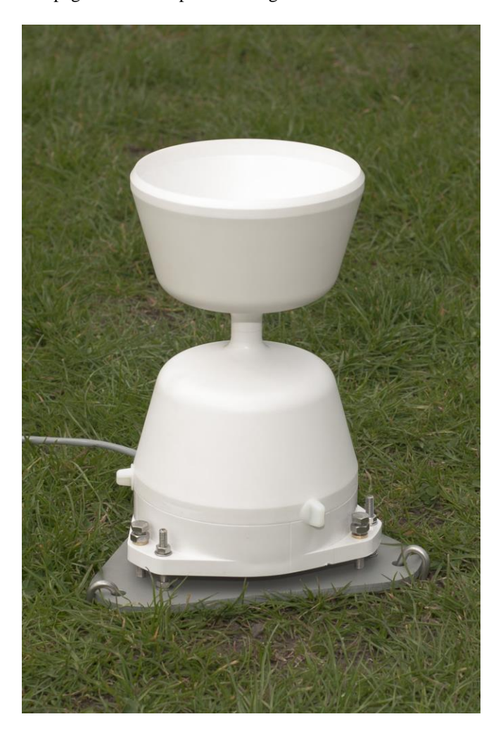
Figure 3. The Kalyx gauge fitted on the ground mounted baseplate that is held down with pegs/stakes.

For fast, semi-permanent installations the optional Kalyx-RG baseplate can be used with tent pegs to hold the plate to the ground.