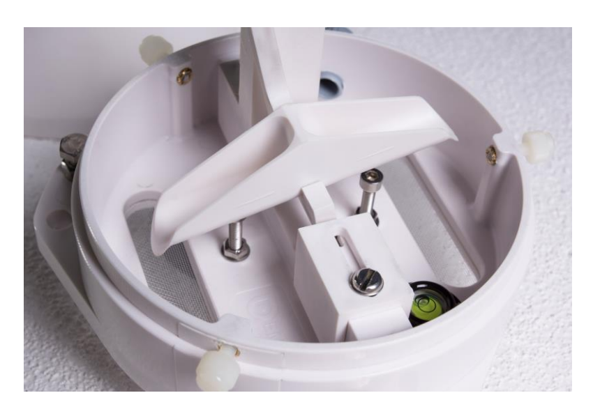
Figure 2. Internal view of the Kalyx showing the tipping bucket mechanism and level indicator.

The Kalyx-RG is adjusted at manufacture to tip once for each 0.2 mm of rain. Unlike more expensive sensors in this range, no detailed calibration certificate is provided with each gauge showing variation from the 0.2 calibration.