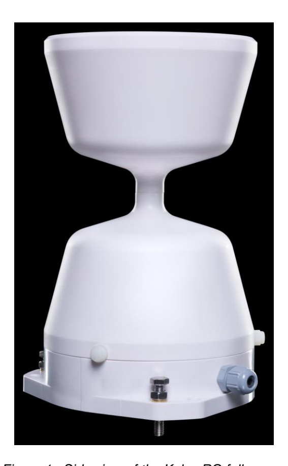
Figure 1. Side view of the Kalyx-RG fully assembled.

The Kalyx-RG rain gauge is constructed from UV-resistant, plastic and consists of a base and an upper collecting funnel assembly. This gauge is based on the physical size of the traditional 5 inch Met Office rain gauge but with a unique aerodynamic profile.